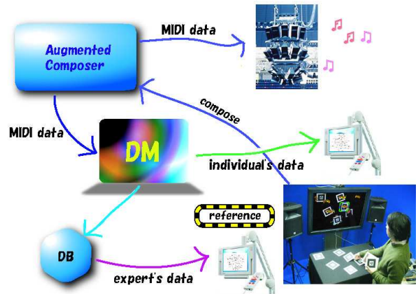
Fig.9 Music composition cycle

We propose the system shown in Fig. 9. This figure shows a cyclic music composition by referring to an automatically generated reference. That is, a multiple sequence of composition, comparison, and improvement is a composition cycle for non-experts. This circulation will work as an automatic education for non-experts.