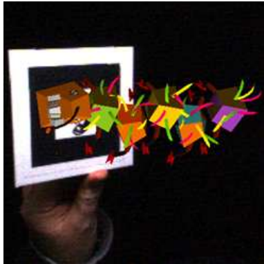
Fig.3 A long, spiky creature corresponding to a long, loud note

The onscreen animated characters serve to complement the physical representation on the table by giving extra information about the notes being played. When a note's turn comes to actually make a sound, the onscreen character will suddenly jump to give the user some indication of the state of the timeline.