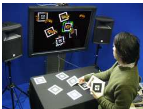
Fig. 1 Augmented Composer

The overlapping tactile and visual representations of the music help reinforce one another in a way that can provide a form of interaction and representation not possible with mouse, keyboard and screen (Fig. 1). By giving the player a physical model of the music, the abstract nature of music can be experienced on an intuitive level.